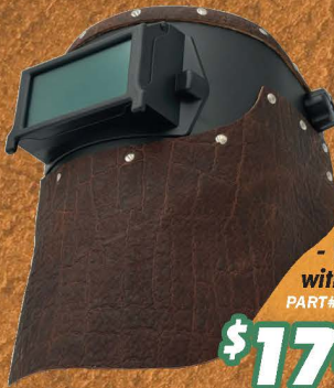
Brown Faux Elephant - Welding Hood with Flip Up Lens PART# OUTOL-BFE-101