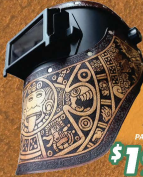
Aztec Calendar Natural - Welding Hood with Flip Up Lens PART# OUTOL-AZN-101

Open till noon Saturdays 559 733-2335 2239 E. Main St. Visalia, CA 93292