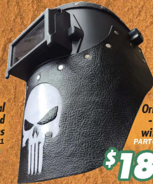
Original Punisher - Welding Hood with Flip Up Lens PART# OUTOL-OPN-101