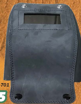
Black Leather Pocket Mask Non-ADF PART# OUTOL-BKM-701