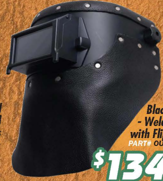
Black Leather - Welding Hood with Flip Up Lens PART# OUTOL-BL-101