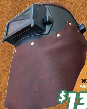
Brown Leather - Welding Hood with Flip Up Lens PART# OUTOL-BR-101