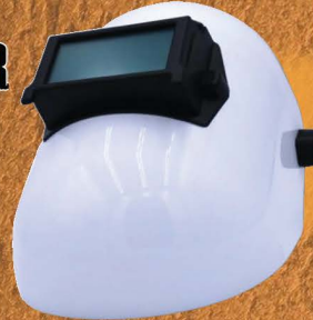
Proliner 1901 with Flip Up Lens PART# OUTOL-1901-103