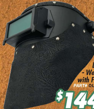
Black Floral - Welding Hood with Flip Up Lens PART# OUTOL-BFS-101