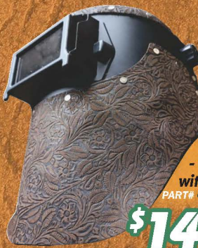
Brown Floral - Welding Hood with Flip Up Lens PART# OUTOL-BRFS-101