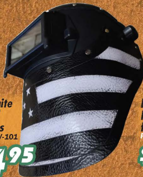
USA Black & White - Welding Hood with Flip Up Lens PART# OUTOL-USBW-101